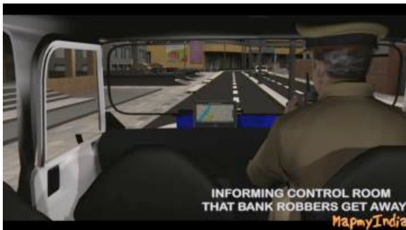
In-vehicle accurate navigation to incident with voice guidance in local languages