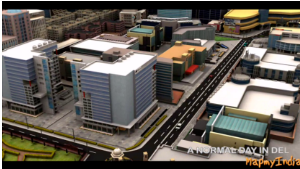
Accurate 3D, House & Building-level Street Maps